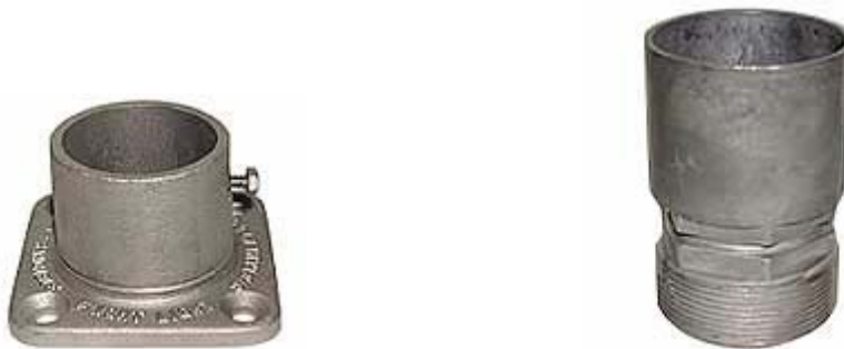
Figure 2. Examples of Frangible Couplings

b. Common applications of frangible couplings (Figure 2) are found in light posts, masts, and electrical metallic tubing (EMT) supports for runway and taxiway lights (See ACs 150/5345-44, 150/5345-46, and FAA Drawing C-6046 for frangibility requirements). It is important to recognize that many types of frangible couplings are available, and only those types approved for the purpose or application originally intended should be used.