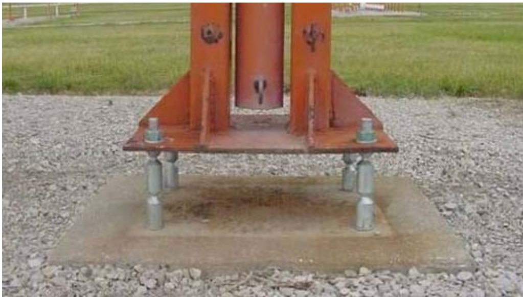
Figure 1. Application of Fuse Bolts

a. Failure of this type of connection is induced by providing a “stress raiser,” due to removal of material from the bolt shank. One method used to achieve this is to machine a groove to reduce the bolt diameter or to machine flats in the sides of the bolts, making it weaker in a specific direction. Shear strength is maintained and tensile strength is reduced by machining a hole through the bolt diameter and locating it out of the shear plane. Fuse bolts must be carefully installed to ensure they are not damaged or overstressed when tightened. One disadvantage of fuse bolts is that the stress raiser may shorten the fatigue life of the bolt or may propagate under service loads and fail prematurely. Fuse bolts with machine grooves are commercially available. See Figure 1 as an example of the application of such fuse bolts. (Reference ICAO Aerodrome Design Manual , Part 6, Section 4.5.2.a)