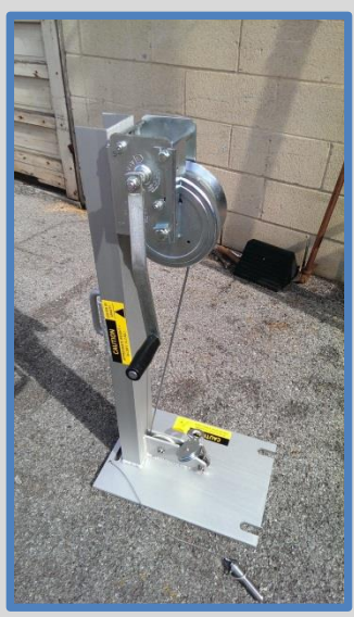
L5005 Tilting Device

Inspection of Tilting device (L5005), Trailer Jack Stand (L5006) and Mast Base assembly should be preformed prior to lifting or lowering any LIR Mast